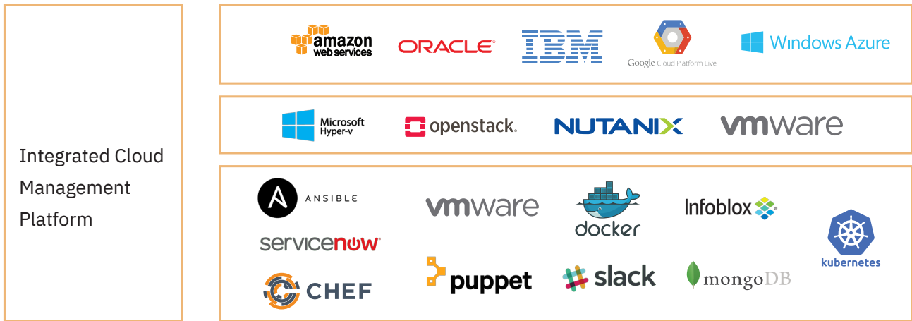
Exhibit 1: NSEIT CMP at a Glance

The cloud management platform architecture is designed to provide consolidated public and private cloud environments with a single-user portal. The CMP enables enterprises to track IT resources, compliances, and cloud spending in a single window.